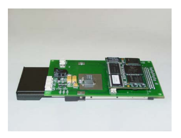
Figure 5. Bottom side of the Compact Ad Hoc Networking Radio, showing the nanoEngine processor card.