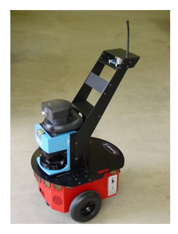
Figure 2. A Pioneer robot configured for communications relay and rearguard functions.

perform the convoying function. A magnetic compass facilitates orientation for navigation using global maps. To provide rearguard functions, we installed on each Pioneer a Sony pan-tilt-zoom camera and a microphone (Figure 2). These will be used in conjunction with the onboard sonars and ladar for intrusion detection in areas that the lead robot has passed through and are supposed to be clear of hostile elements.