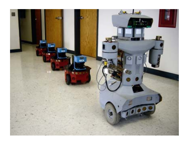
Figure 1. Four relay robots convoying behind the lead robot (laboratory demonstration scenario).

To maximize resources and allow for extended explorations, unneeded relay nodes should be reclaimed and reused. We accomplish this function through the use of mobile relay robots that follow the lead robot in convoy fashion (Figure 1), stop and act as relay nodes where needed, and catch up to the lead robot to be redeployed when no longer needed. These activities are all performed without the operator's involvement. With minimal additional sensory hardware, these relay nodes will also act as rearguards, preventing areas previously tagged as clear of hostile elements by the lead robot from being re-occupied without detection.