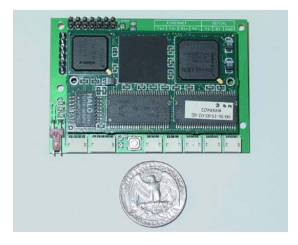
Figure 3. A nanoEngine and its daughterboard.

hardware codec (4.14" x 2.14" in size). The VP604 supports four input analog video channels and one output video channel in S-video, RGB, or composite (CVBS) format, plus analog audio input/output, and communicates over a standard 10/100 Base Ethernet network. A daughterboard for the VP604 was similarly developed that provides regulated power, access to all ports, a microphone differential preamplifier with Automatic Gain Control (AGC), and a 675mW audio amplifier with manual volume control for the output audio channel. Indigo Vision is working on advanced motion detection functions for the VP604 under a separate contract from SSC San Diego.