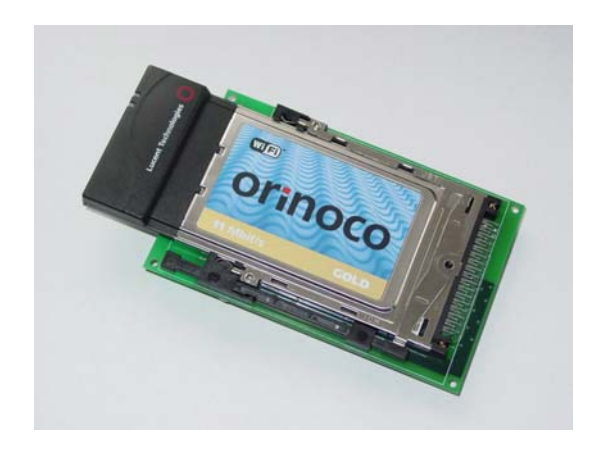
Figure 4. Top side of the Compact Ad Hoc Networking Radio, showing the Wavelan PC Card.

This software has been incorporated into a set of compact ad hoc networking wireless modems, each the size of a pack of playing cards (Figures 4 and 5). Each stand-alone wireless modem contains an 802.11b wireless LAN card (the ORINOCO WaveLAN PC Card Gold), a nanoEngine, and a Radio Interconnect Board (RIB) developed by us. It also has connectors for external power and antenna, as well as Ethernet and serial communication ports.