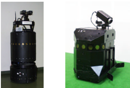
Fig. 3. The B21 and Sparrow-99 robots.

The Miro implementation includes a number of clients,